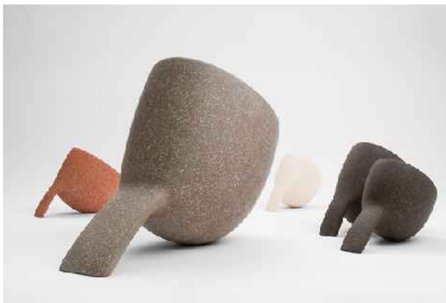
I am Too